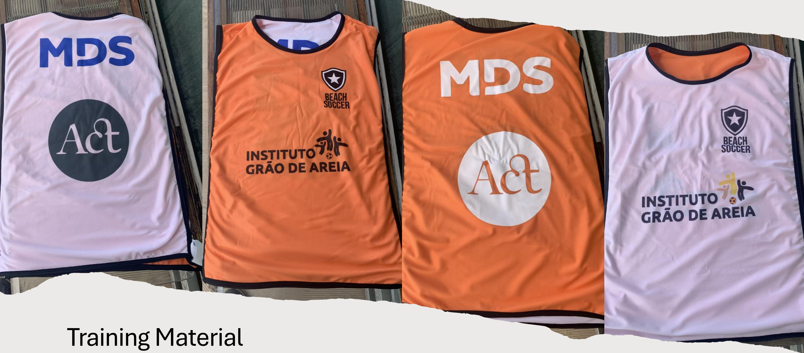
Training Material Double Face Bibs